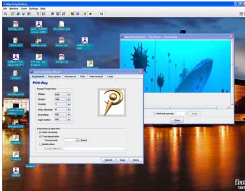
Fig. 1. Migrating Desktop main window

The Migrating Desktop Platform is a powerful and flexible user interface to Grid resources that gives a transparent user work environment and easy access to resources and network file systems independently of the system version and hardware. It allows the user to run applications and tools, manage data files, and store personal settings independently of the location or the terminal type.