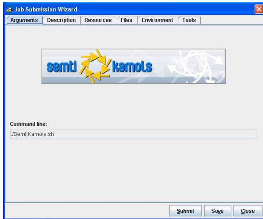
Fig. 4 SentiKamols application – job submission plug-in.