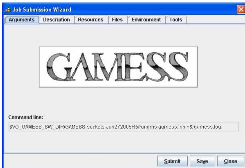
Fig. 2 GAMESS application – job submission plug-in.